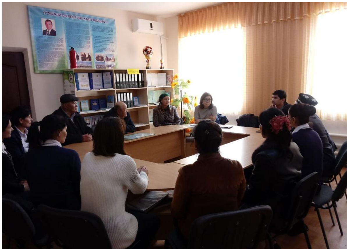
Figure 6-1: Meeting at School 26