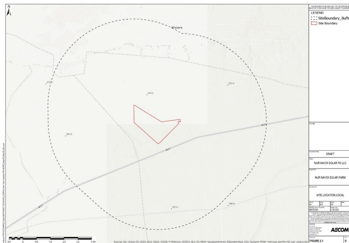
Figure 2-2: Project Site

It is proposed to locate the necessary infrastructure in the eastern part of the plot, immediately adjacent to the substation and 220kV overhead line to which the PV power plant will connect. The site is accessible via the existing M37 highway and minor road leading to the substation and compound area; minor upgrades to short sections of unsealed road after the junction with the M37 and within the site will be required to accommodate heavy construction vehicles entering the site.