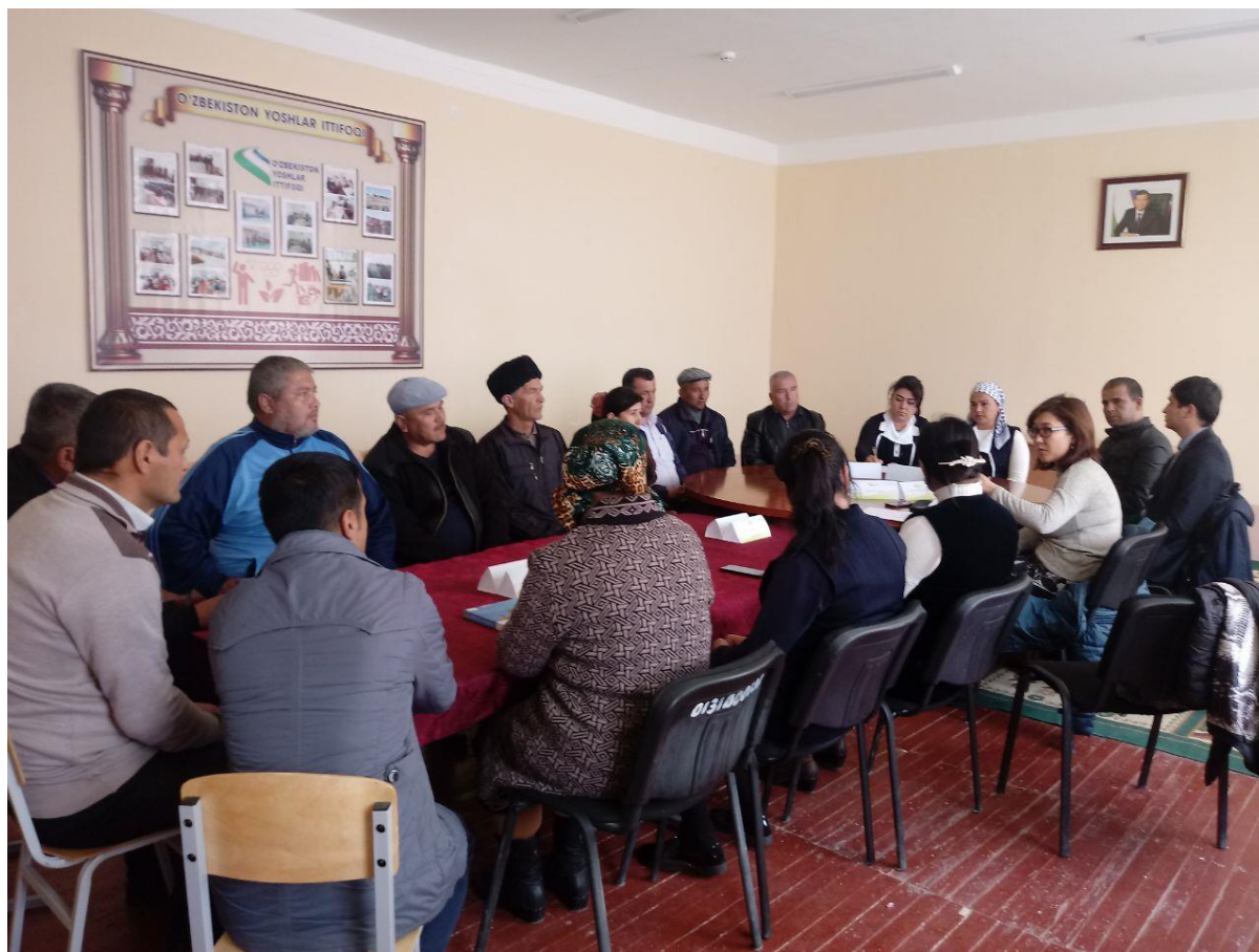
Figure 6-3: Meeting at School 23