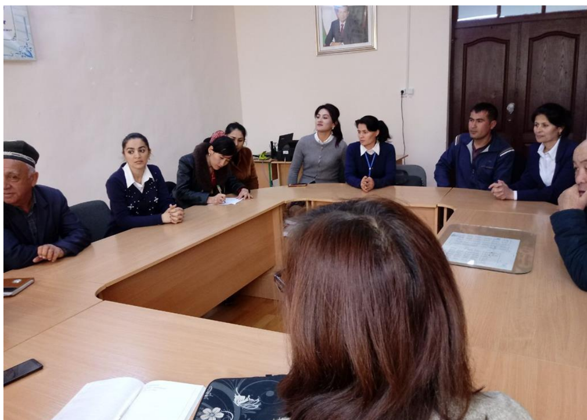
Figure 6-2: Meeting at School 26 (2)